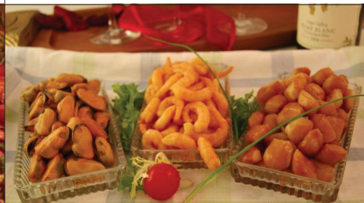
Shellfish Smoked Assorted Shrimp/Scallop/Mussels Product # KH120 • Size 2 lbs. each, 6 lbs. total

Fresh Wild Alaskan Salmon strips, that have been cured with a natural wildflower honey and spices, and cold smoked. They make an excellent garnish or accent to a dish or cocktail. All natural, no artificial preservatives, colors or flavorings.