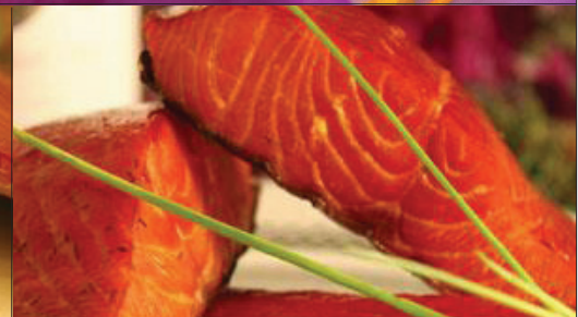
Salmon Smoked Roasted Product # KH110 • Size 2 x 2-3 lb. sides

Sustainably harvested fresh wild Alaskan salmon, that has been all naturally cold smoked, then finished with a hot smoke, creating a firm flaky side. All natural, no artificial preservatives, colors or flavorings.