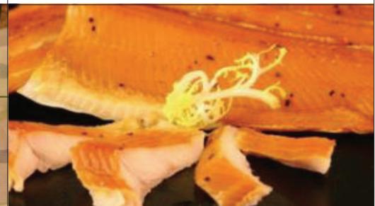
Trout Rainbow Fillet Smoked Roasted Product # KH124 • Size 10 x 8 oz. fillets

An assortment of 2# of each, our smokiest specialty with its characteristic nutty flavor starts with rope-grown, cold-water mussels, Maine shrimp, and bay scallops carefully cold smoked with an all cherry-blend of hardwood. A perfect dish on its own, our smoked shellfish are also incredibly versatile in the kitchen. Ideal for hors d'oeuvres, and canapes or a striking salad garnish.