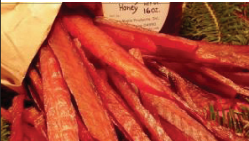
Salmon Smoked Alaskan Wild Candy Strip Product # KH116 • Size 5 x 1 lb. packages

Eco Certified, fresh Salmon that has been carefully cold smoked, then finished with a hot smoke, creating an all natural, firm flaky side. All natural, no artificial preservatives, colors or flavorings.