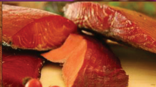
Salmon Smoked Roasted Sockeye Wild Product # KH112 • Size 4 x 1.5 lb. sides

Sustainably Harvested Wild Pacific Salmon which is all naturally Cold smoked and has 45-50 slices per side. All natural, no artificial preservatives, colors or flavorings.